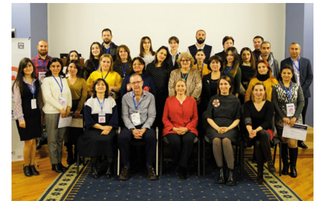
Management and leadership workshop in Yerevan.