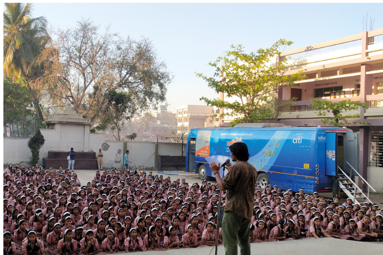
A student orientation session during a Museum on Wheels visit.

Assistant Curator, International Relations In-charge of Museum on Wheels and the Children's Museum Chhatrapati Shivaji Maharaj Vastu Sangrahalaya, Mumbai (India, ITP Fellow 2016)