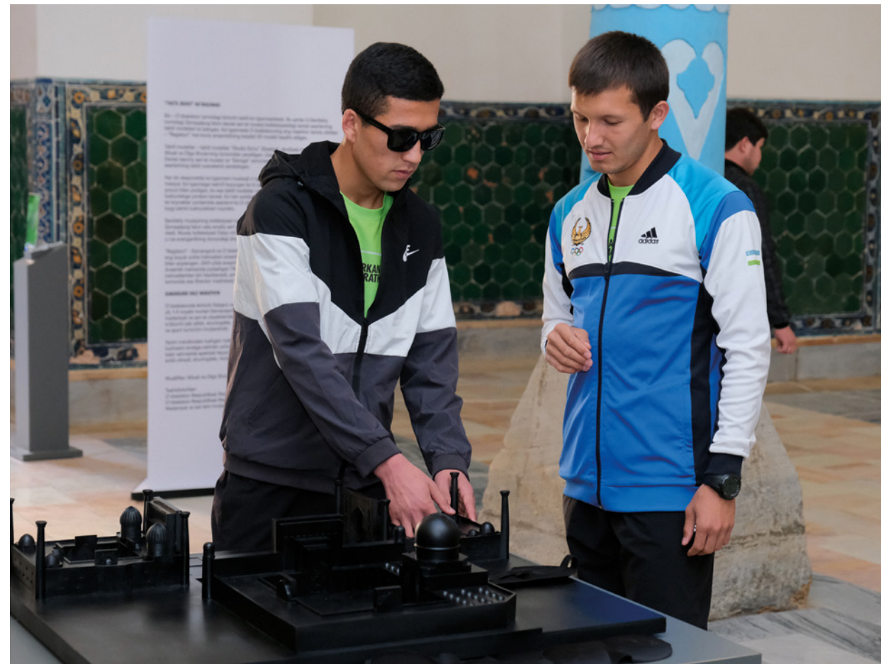
Engaging with our visually impaired visitors.