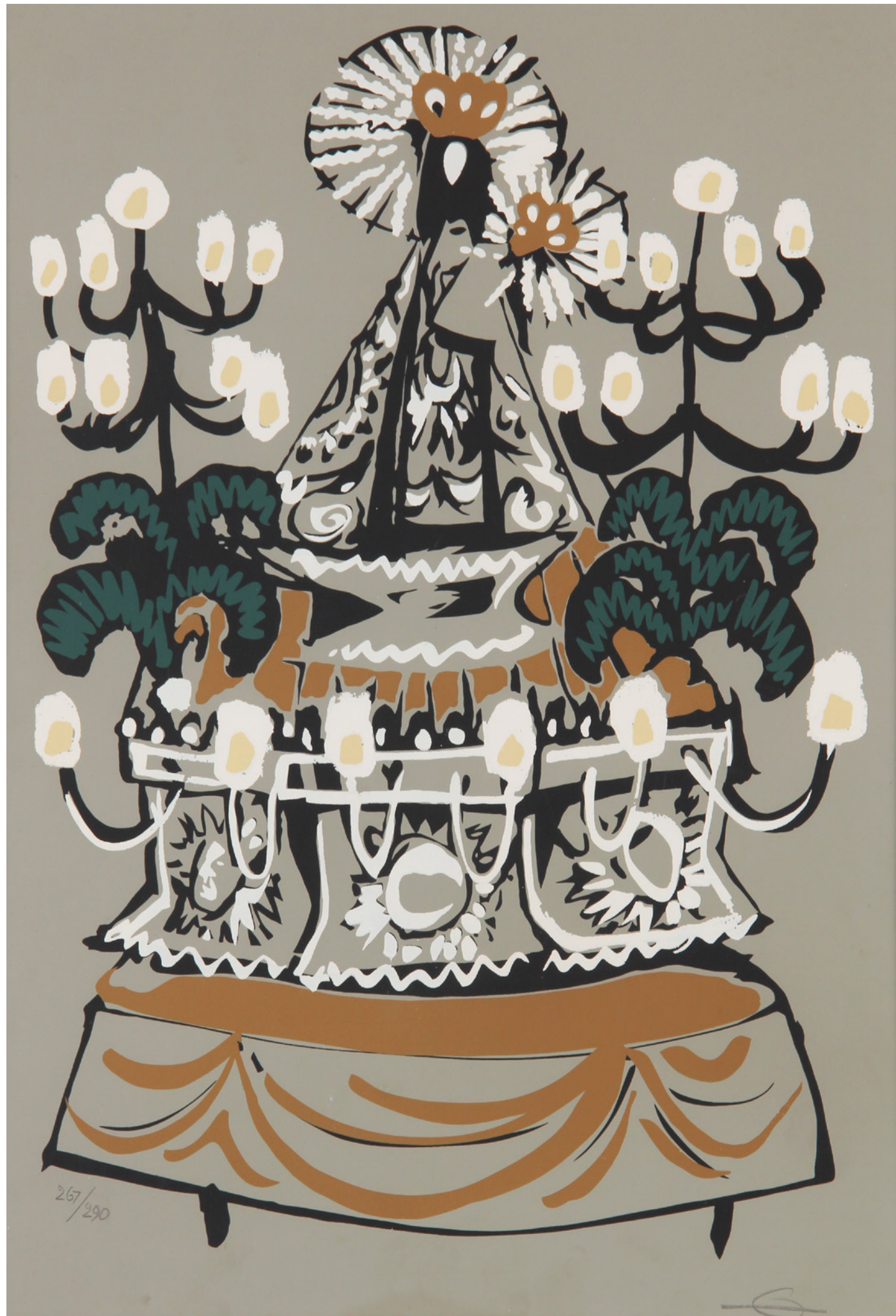
Fernando Zobel, CARROZA, 1953, Serigraph 267/290 CARROZA, 74x56cm, Ayala Museum Collection.