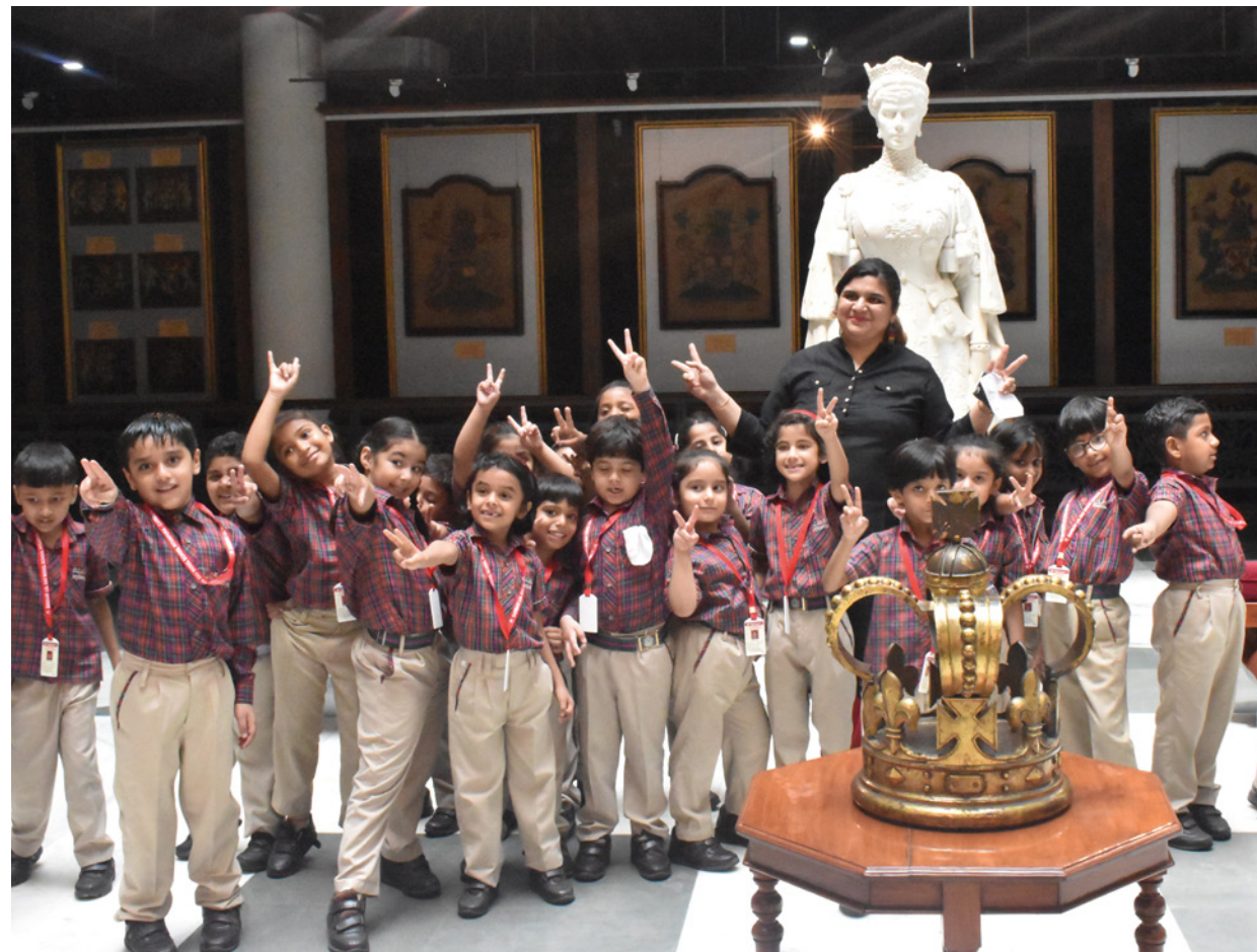
Younger school kids visiting the Museum.