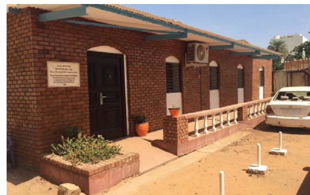
The M. Bolheim Bioarchaeology Laboratory in Khartoum.

Project Curator: Sudan and Nubia, Department of Egypt and Sudan, British Museum