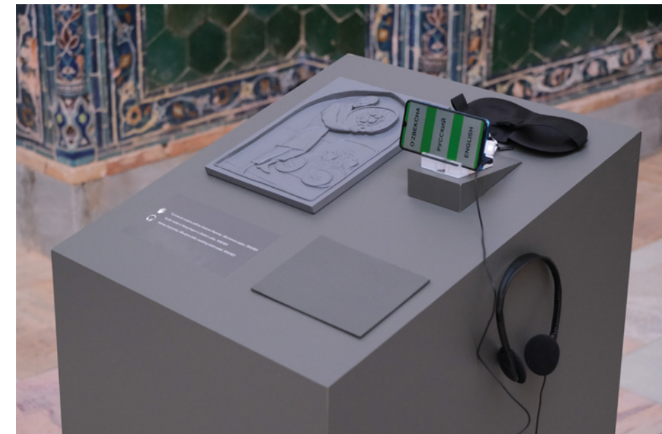
Visitors using the audio guides, descriptive guides and braille text.