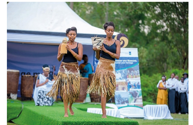
Fashion show during celebrations for Rwanda Museums' 30th anniversary.