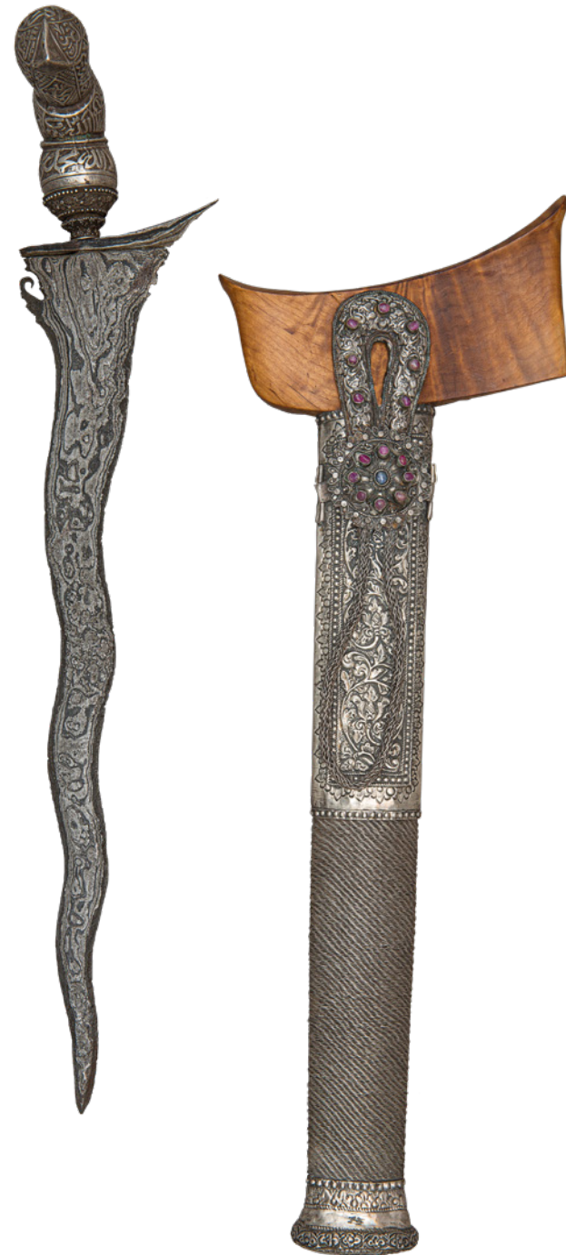
A Malay silver 'keris' inscribed with Islamic calligraphy, 19th century.

Curator, Islamic Arts Museum Malaysia (Malaysia, ITP Fellow 2017)