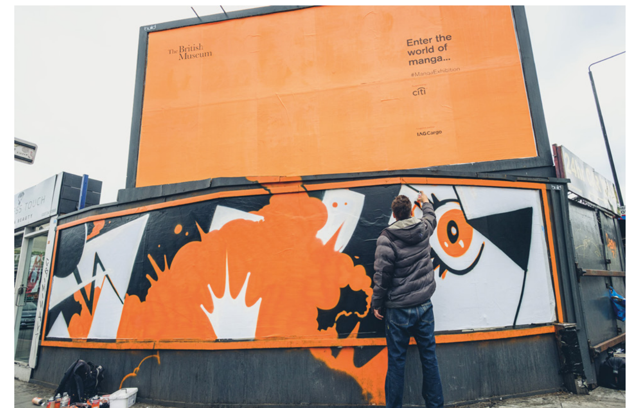
Posters for the Citi exhibition Manga were installed in Shoreditch. Here artist Tom Blackford responds to the Japanese popular art form as part of a commission to create a graffiti wall underneath.

Find out more You can find a selection of British Museum evaluation reports online here: research.britishmuseum.org/research/research_projects/all_current_projects/visitor_research.aspx