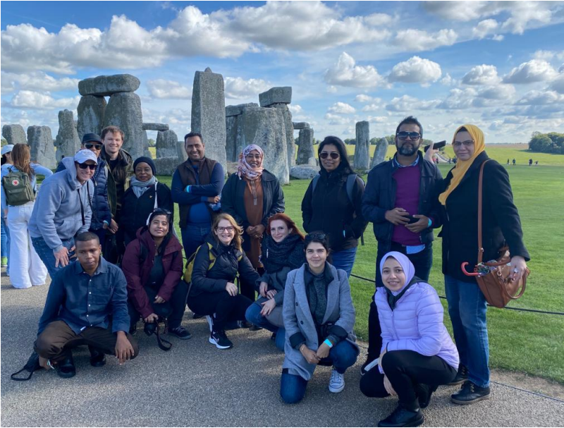
First group photo while enjoying Stonehenge together.