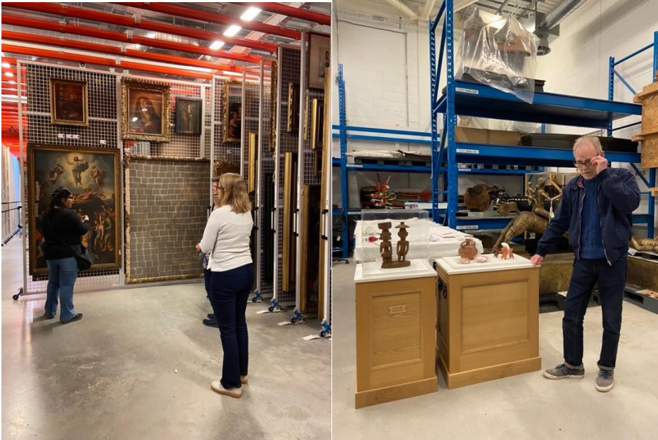
My delightful experience at the Glasgow Research Center won't be forgotten. Visiting its infinite collections, you can travel the world. And this journey is much better if you do it with people who inspire and support you.