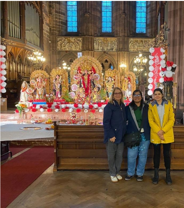
The ITP global experience taught me much about my colleagues and their cultures. Being able to experience together a part of their lives was one of the most enriching parts of the program. Sarbojanin Durga Puja, Glasgow 2022.