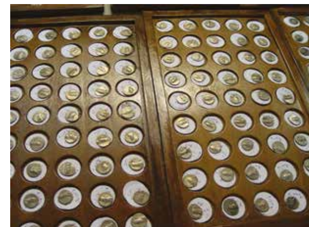
Newly acquired coins at the National Museum of Iran.

Keepers of Department, National Museum of Iran (ITP 2008, 2007)