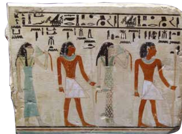
Objects on display at the new Egyptian Museum at Cairo International Airport.