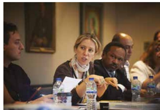
Participants engaging in discussion at an ITP 2015 group session.

ITP+ programmes. These will consist of five-day workshops on selected themes. ITP+ will focus on a specific part of the current summer programme that responds to participants' stated areas of interest and development needs, helping to address current challenges at their home institutions. Currently we are conducting a needs analysis of our alumni to select the most useful themes for these short courses.