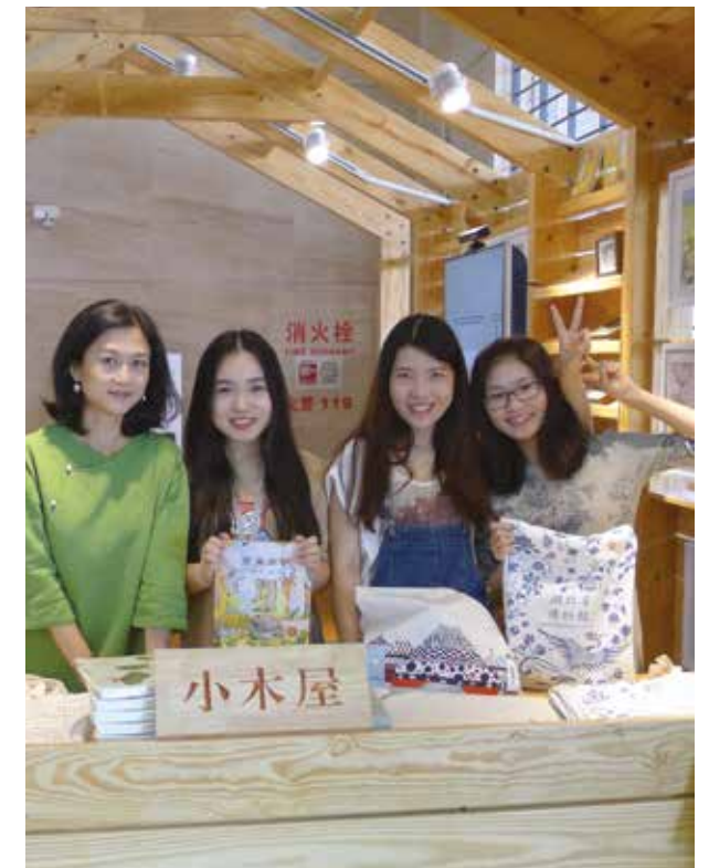
Wooden house at the Great North Museum: Hancock.

Since February 2015, as part of the programme, we published three primary books for children, five pieces of interactive multimedia software and delivered three open house activities. The house has had over 26,000 visits. This is also the first time ever we have been supported by an external organisation. It's an approach derived from my experience on the ITP. When I participated in the programme, I learned the importance of social support and how public participation helps to improve museum services. I am also determined to carry forward the lessons I learned on the ITP and apply them to my work in the future.