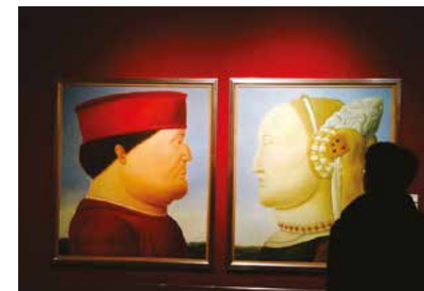
Objects at the Botero in China exhibition, National Museum of China.