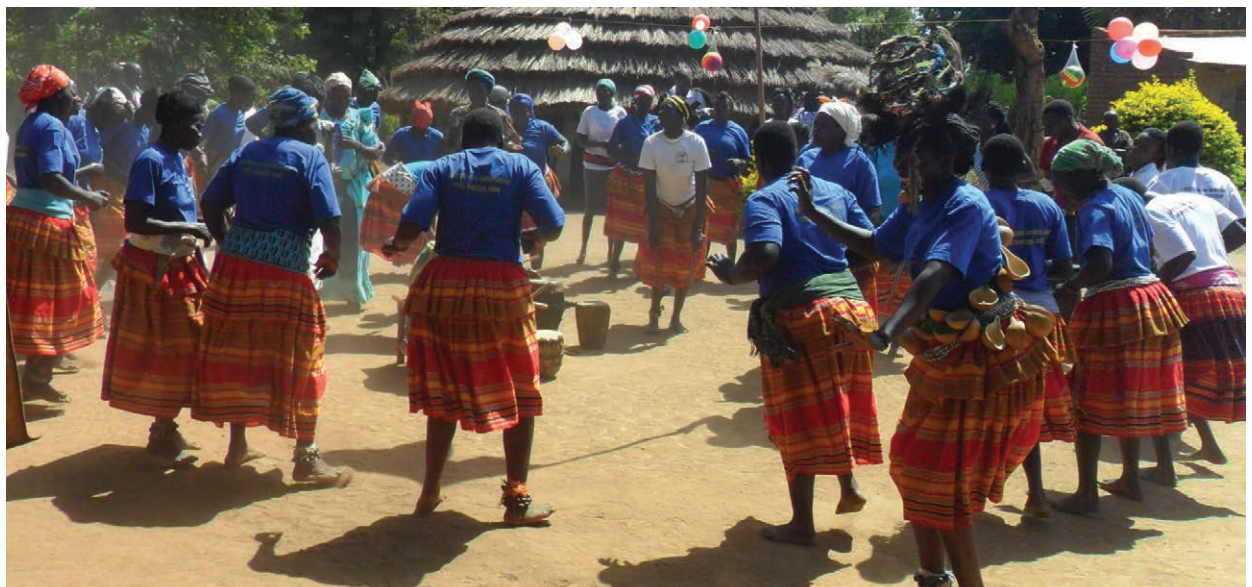
Community memorial dance at Dure Community Museum 2016.

Ethnography Section, Department of Museums and Monuments, Uganda (ITP 2013)