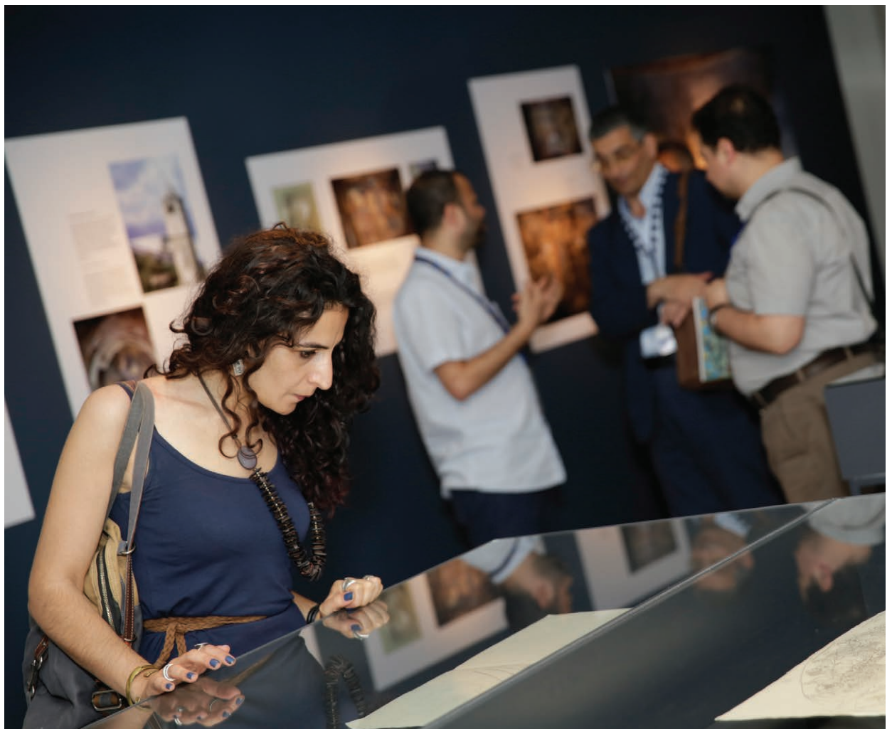
A view from the gallery.