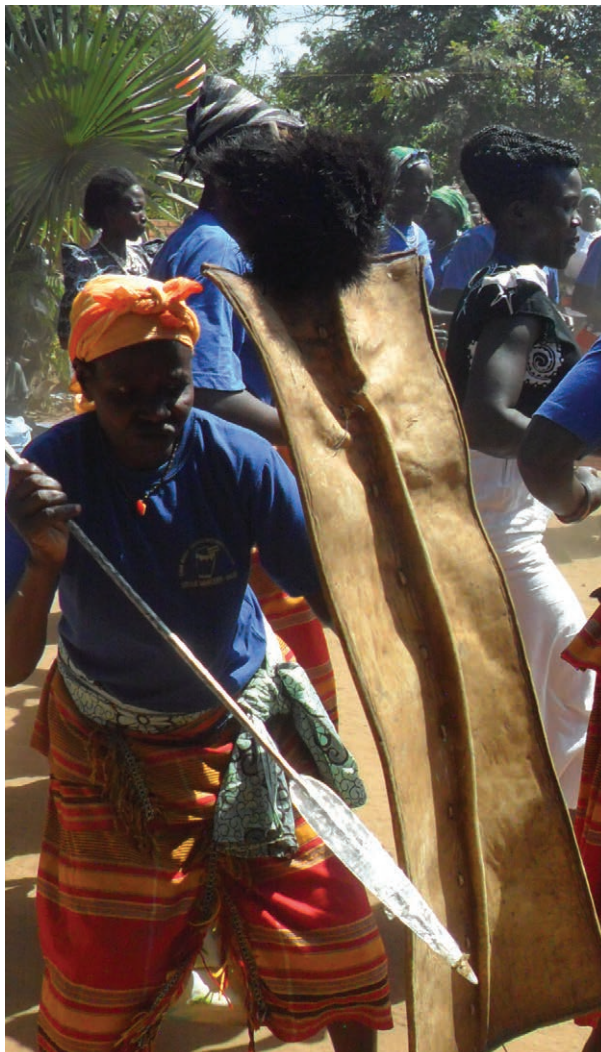
An Acholi ritual spear in use at a community ceremony in Uganda.