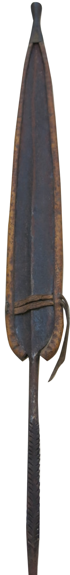
Acholi ritual spear from the Luo (Nilotic) culture, 19th–20th century.