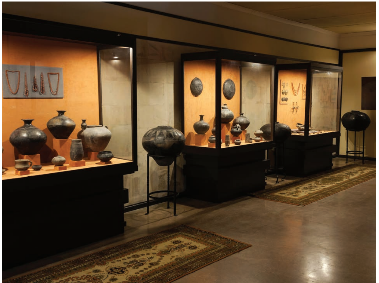
Permanent Exhibition Hall, Metsamor Historical- Archaeological Museum Reservation.

Head of Museum, Metsamor Historical-Archaeological Museum-Reserve