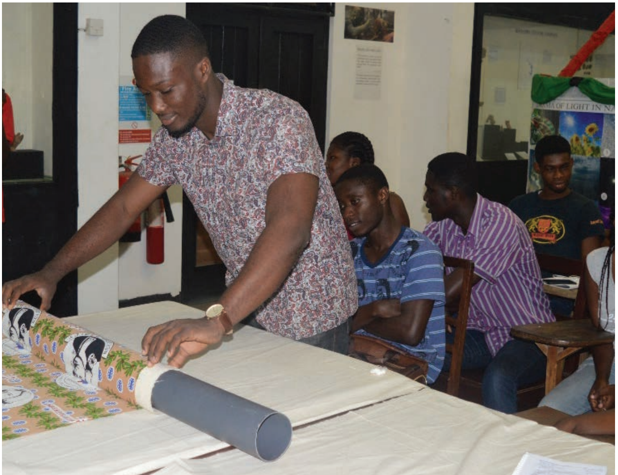
A Museum Studies student learning how to roll textiles for storage, Museum of Archaeology, Legon.