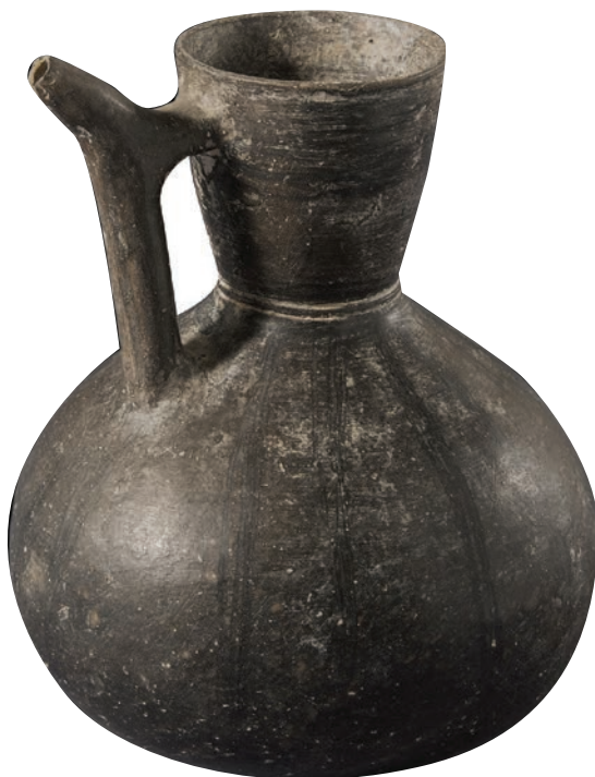
Ceramic grey ware, Qeytariyeh, Tehran, Iran, c.1200-1000 BC.

Cultural and Historical Properties Expert, Iranian Cultural Heritage, Handicraft and Tourism Organization