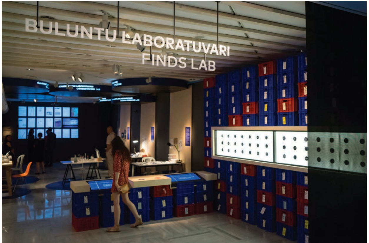
View of the ANAMED exhibition The curious case of Çatalhöyük .

Gallery Curator, Koç University's Research Center for Anatolian Civilizations (ANAMED)