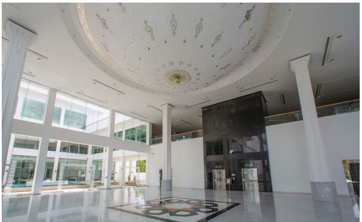
Inverted dome, Islamic Arts Museum Malaysia.

Curator (Arms and Armour), Islamic Arts Museum Malaysia (IAMM)