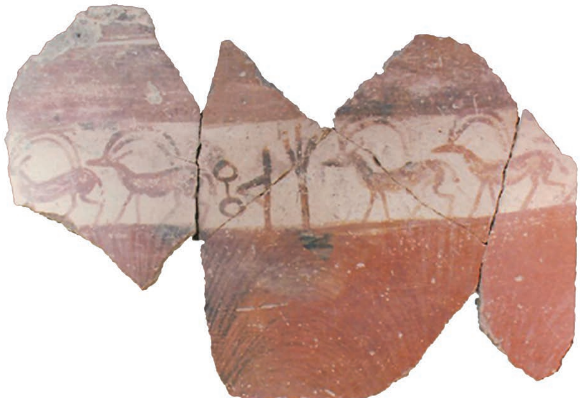
Pottery fragments pieced together, depicting ibexes walking in line, with three letters of ancient South Arabian script Musnad .