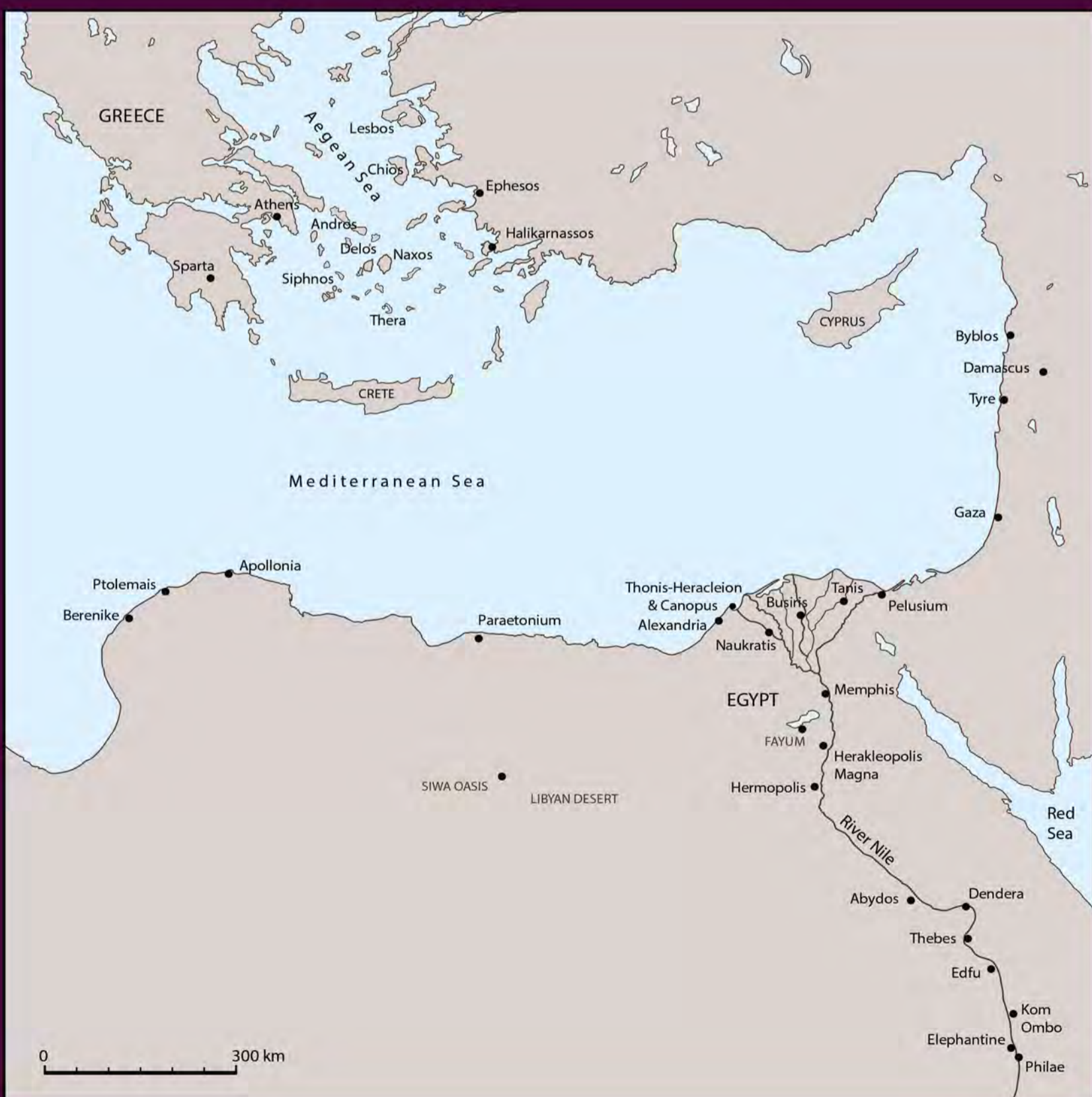
Map of the Eastern Mediterranean showing Naukratis and Cyprus